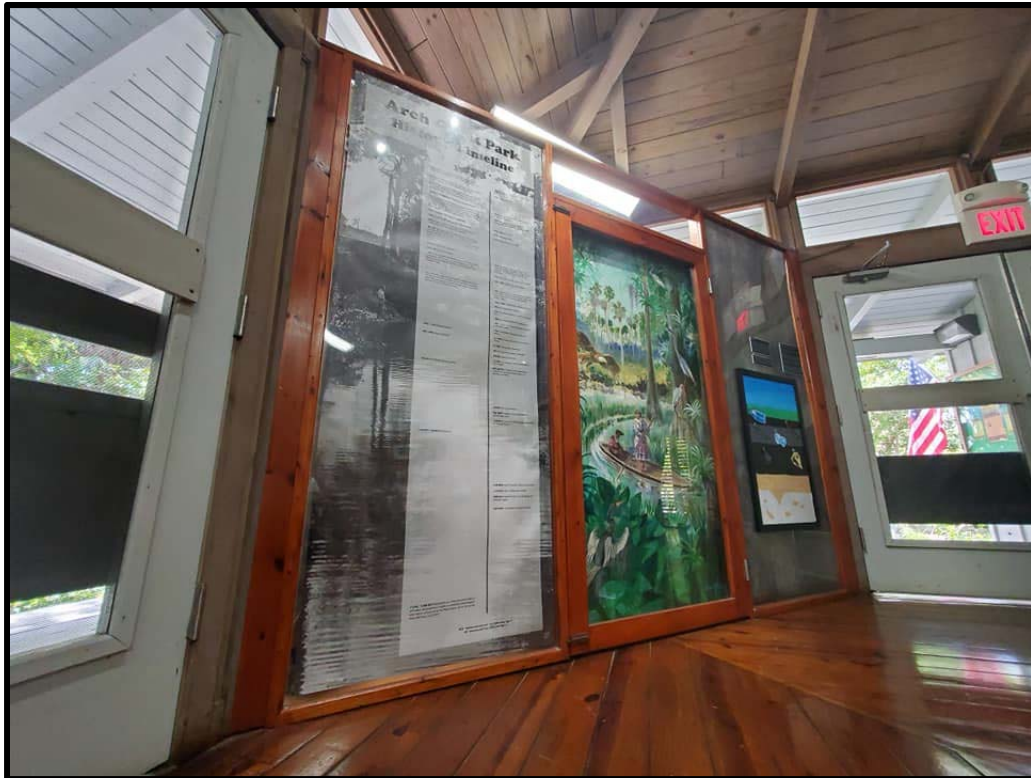
Section of Updated Exhibit at Arch Creek park

The new exhibit includes a timeline that puts the site into context of the history of South Florida and global history. It also features artifacts identified at the site during excavations in the 1980s.