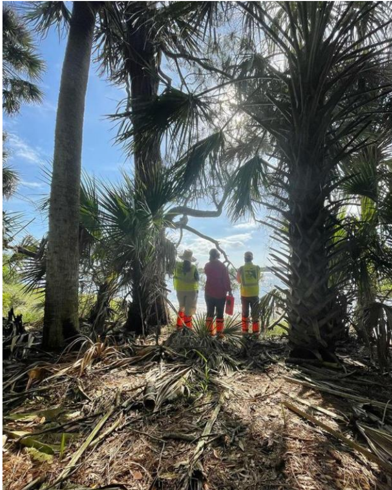
Monitoring sites in the GTM NER

The East Central Region staff, along with Northeast and Southeast Region staff, mapped the erosional edge of the Guana-Tolomato peninsula and monitored numerous archaeological sites. The 3-day shoreline mapping project utilized the Eos Arrow GNSS system to get high end accuracy to track shoreline erosion. The shoreline was mapped originally by FPAN staff in 2020, one year later staff mapped the same shoreline showing areas of erosion and storm damage.