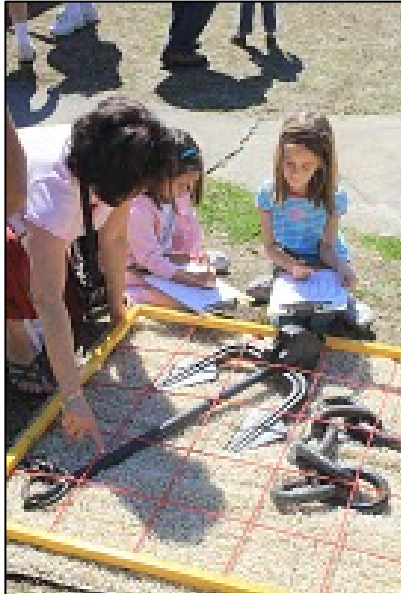
"Map an Anchor" Activity.