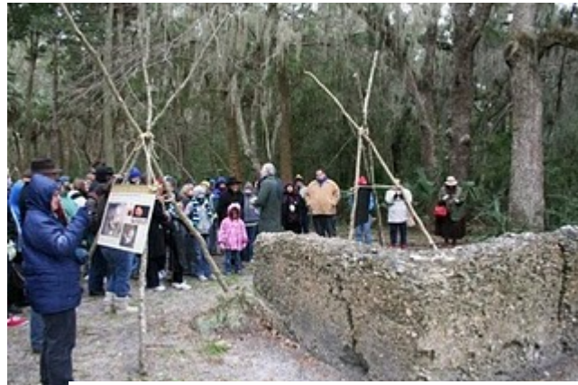
Public attends tours at SHA Public Day.