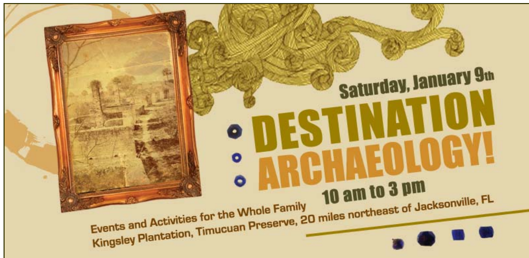
Poster for SHA Public Day 2010.