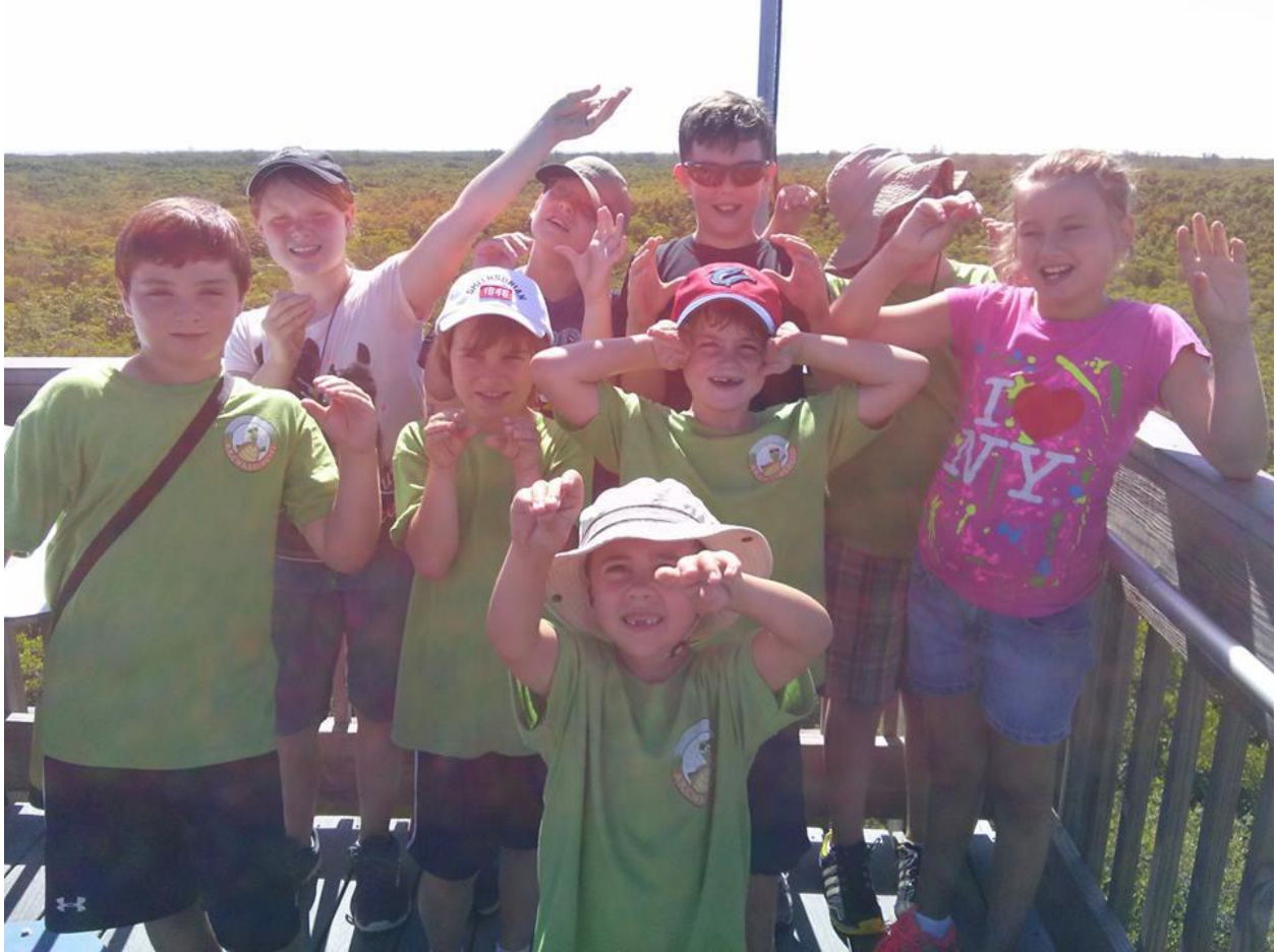
Summer campers atop observation platform at Weedon Island Preserve in Pinellas Co.