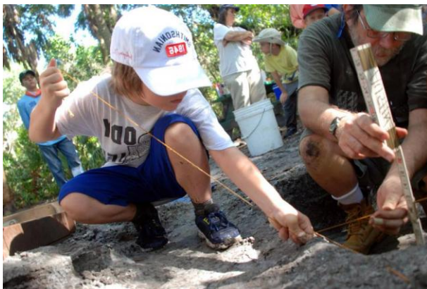
Summer Camp Jr. Archaeologist learns how to measure unit elevation and receives instruction on proper excavation techniques.