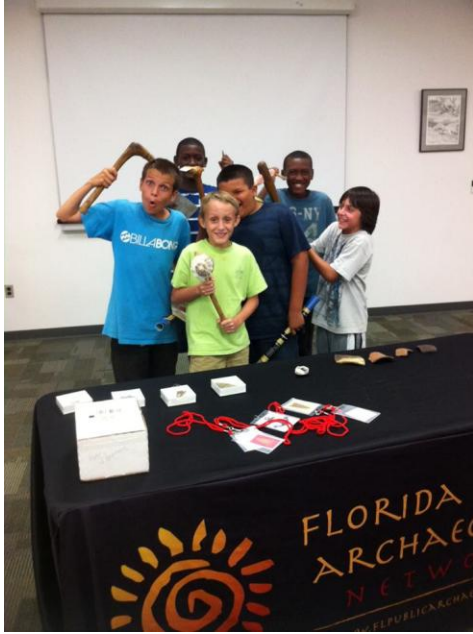
These guys had fun with replica artifacts after library program in Manatee Co.