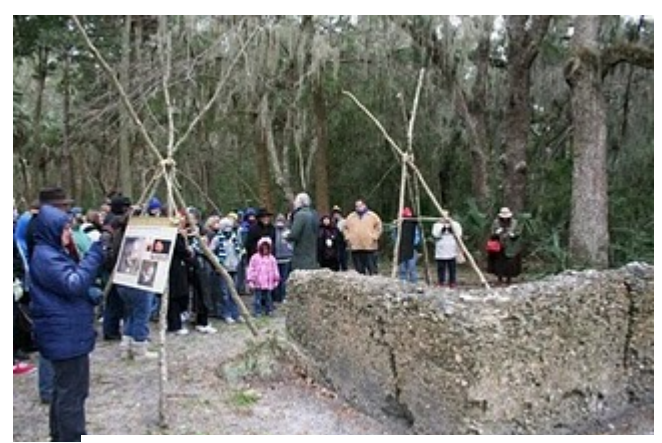
Public attends tours at SHA Public Day.