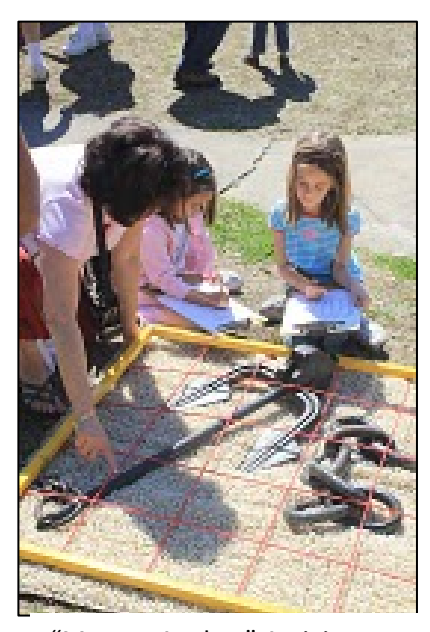
"Map an Anchor" Activity.