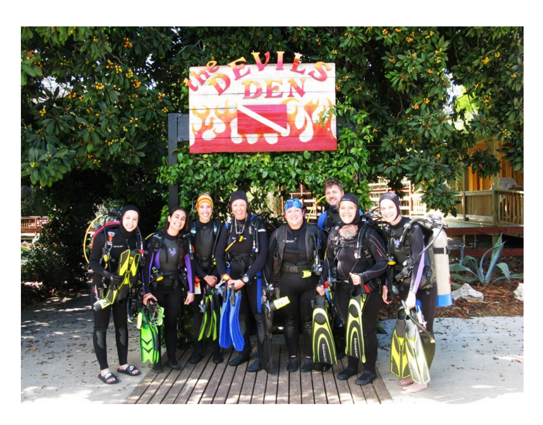
FPAN divers pose before their proficiency dive at Devil's Den, Williston, FL.