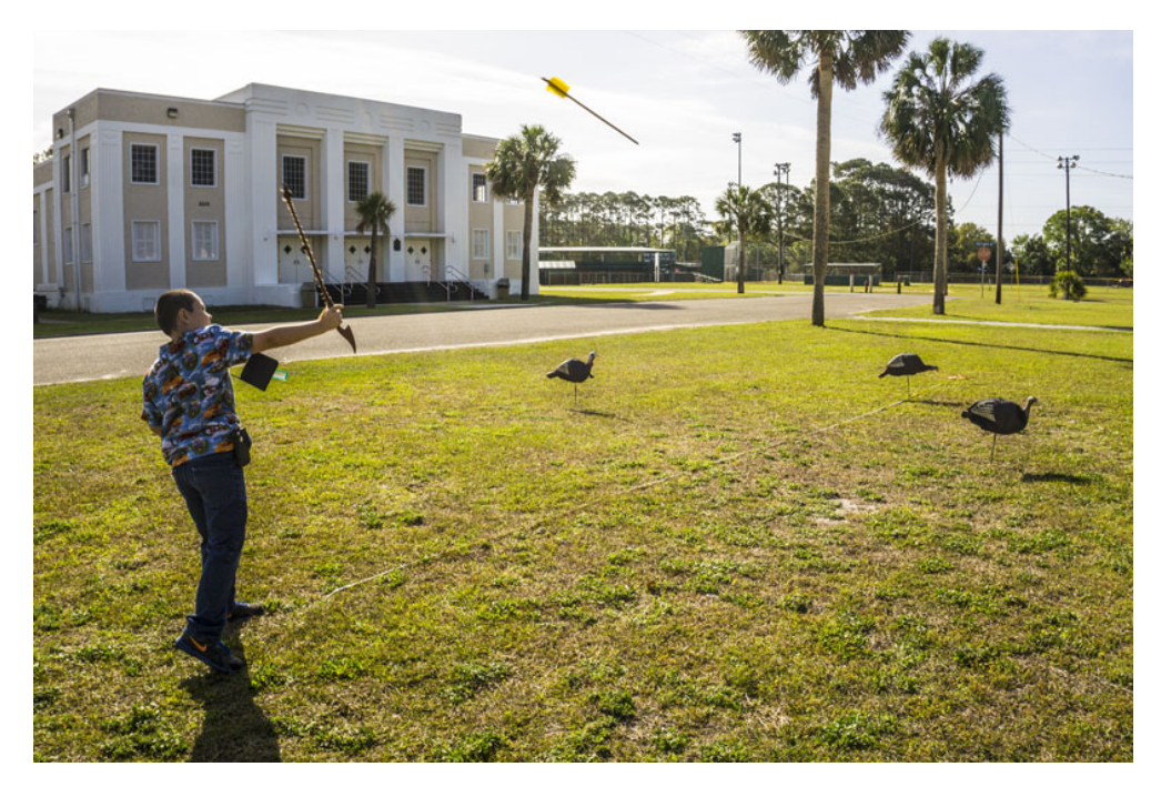
A young participant in FPAN Northwest's "Dash through the Past" in Port St. Joe attempts to finish one of the scavenger hunt race's challenges: hunting "turkeys" with an atl-atl.