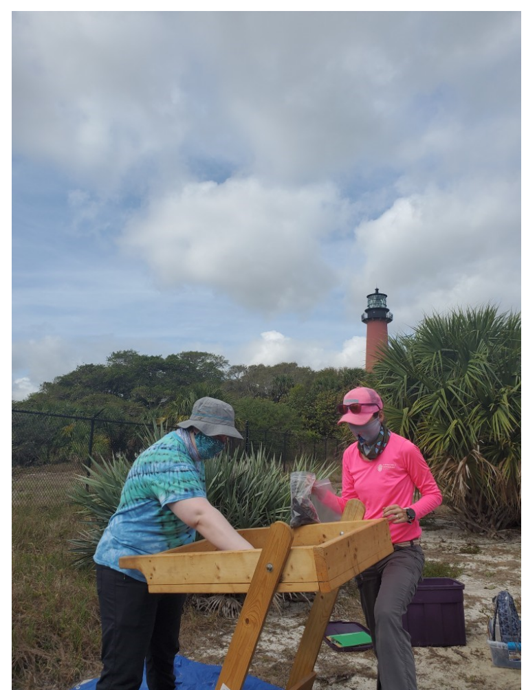
Photo 1: FPAN Staff and bootcamp students screen for artifacts with lighthouse in the background

The virtual portion of the program consisted of interactive evening classes focused on a range of topics. The first highlighted the Bureau of Land Management, featuring Associate Deputy State Director Natural