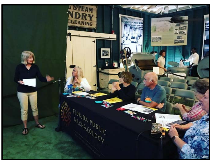
CRPT Volunteers at the Museum of the Everglades

Following the morning in the classroom, participants enjoyed lunch from sponsor <u>Hole in the Wall Pizza</u> and then were able to head out to document a historic cemetery with <u>Everglades</u> Old Time Charters.