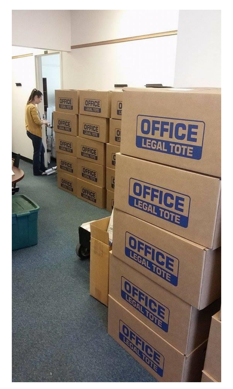
We moved! New WCRC office is located in the SOC building in the main part of USF Tampa campus. So long NEC building... you were great.