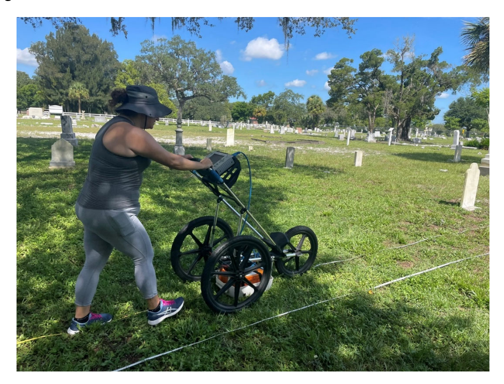
A local volunteer is given a turn to push the GPR in Lakeview Cemetery in Seminole County

burials at the sites. In Duval County, staff worked with the Jacksonville Gullah/Geechee Nation CDC to investigate Reedy Cemetery, and they partnered with members of the St. Nicholas Bethel Baptist Church to take a look at areas in the similarly named cemetery in preparation for a formal survey through grant funds the church received. In Volusia County, staff continued to work with volunteers at Saints and Sinners Cemeteries to better understand the landscape of these sites. And in Seminole County, staff worked with the Central Florida Cemetery Project to if old surveys and plot maps of Lakeview and Page Jackson Cemeteries could reflect what is under the ground.